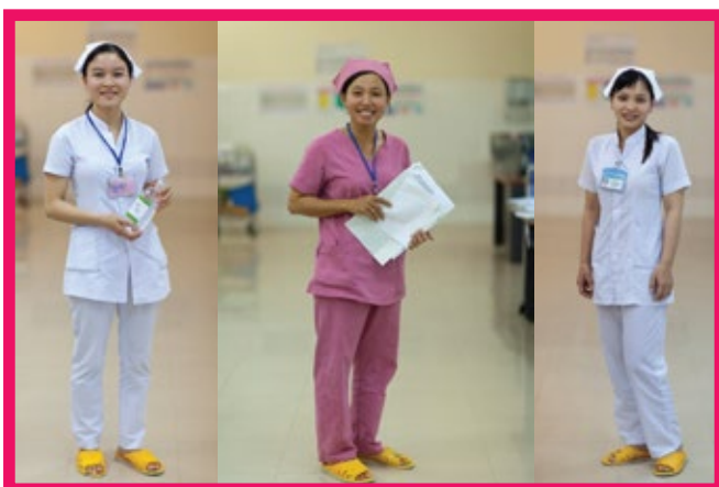
Nurses enrolled for the first course as students of Canterbury Christ Church University & Danang University of Medical Technology & Pharmacy.