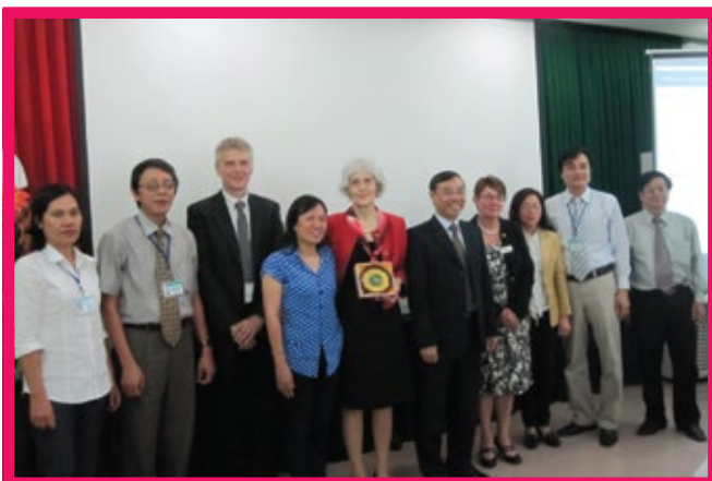
Vietnamese Ministry of Health approves neonatal nurse training course and our Da Nang education partnership