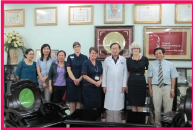
Nurse Education Assessment Report and proposal for a neonatal nurse training programme approved by our Da Nang partners