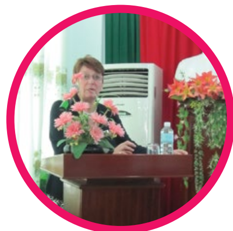
Christ Church Canterbury University Faculty Board approves Neonatal Nurse Training programme for Da Nang Vietnam